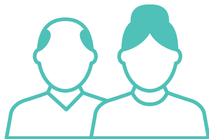
Grandparents & family